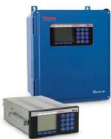
INTEGRATORS & CONTROLLERS